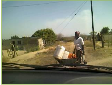
The photos show women pumping water from a government owned pump, then transporting the water several miles to their homes.