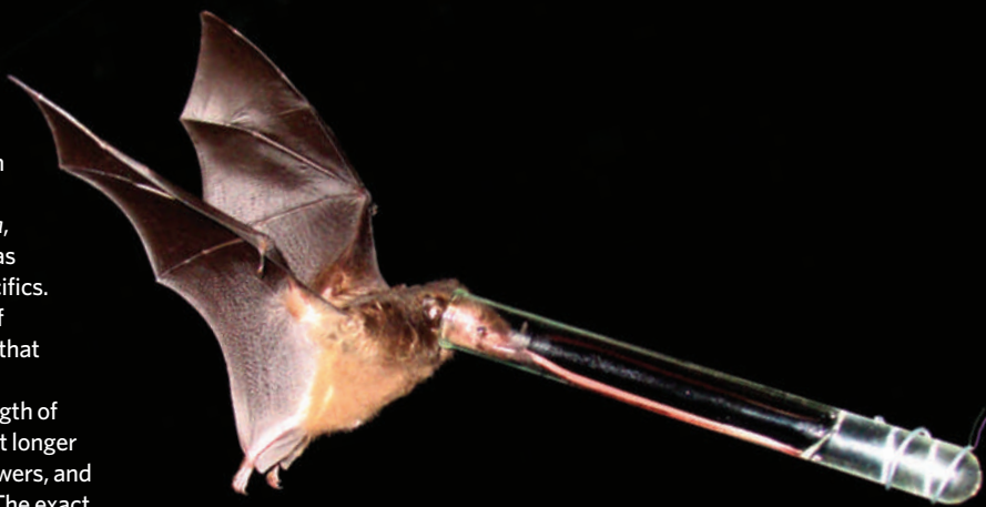
N. MUCHHALA & J.D. THOMSON

The duo experimentally manipulated the length of the flower Centropogon nigricans and found that longer tubes delivered more pollen to bats in male flowers, and took more pollen from bats in female flowers. The exact mechanism, however, remains unknown.