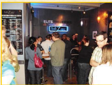
Economics Alumni Party 2011 at SubZero