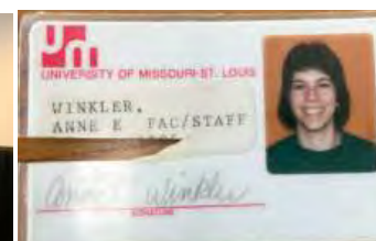
1989 ID card (it used to have our SSN#!)