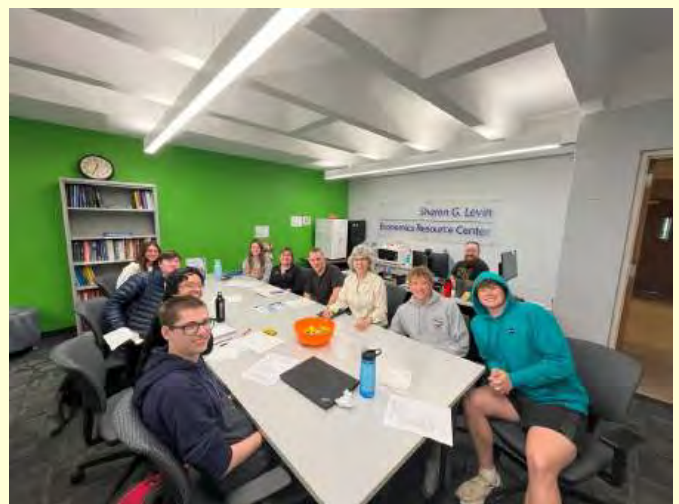
Resume Workshop in the ERC !