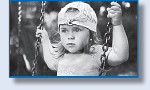
REGISTER BEFORE APRIL 11TH BY 12:00 P.M.!