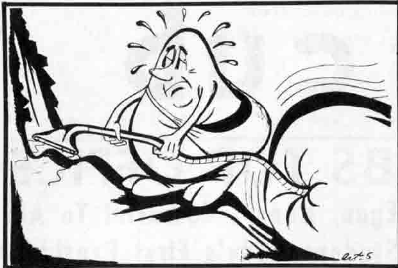
MORE THAN A ONE MAN JOB