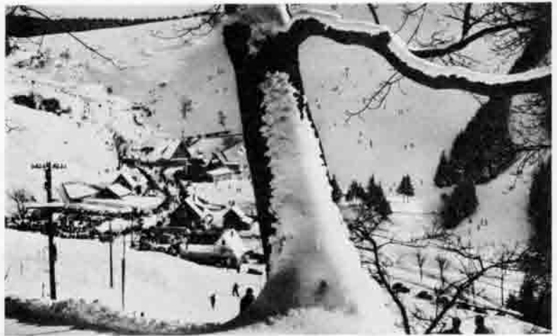
THE SKIING VILLAGE of St. Andreasberg, in the Harz Mountains, as seen during the tourist season.

I soon noticed that many girls were coming to school with arms bandaged from wrist to shoulder and wondered at this strange Berlin disease that often struck on test days. Excuses were interesting: they had to write too much homework; they had to carry too many books; they had inherited weak nerves from parents who had gone through harrowing nights of bombing. These seemed logical reasons and when I became better acquainted I recognized the students' sincerity. They were suffering from painful inflammation of nerves and were probably not even aware of its most obvious cause--pressure exerted by parents and teachers. Failing one subject or getting five (D) in two subjects meant repeating all the following year. A failure the second year resulted in being dropped from school and losing one's chance to attend university. Because there is considerable prestige attached to a university degree in Germany, parents supervise school work most carefully.