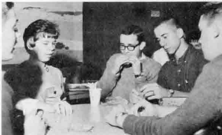
ITS ALWAYS FUN but now its legal. Since the Senate suspended the rule prohibiting card-playing, students now enjoy gaming privileges while they eat.

A higher percentage of deficiencies was reported among students on probation, with negligible difference between the two classes. Close to 75% of the students on probation received deficiencies, with 73.8% of the sophomores on probation receiving them compared to 75% of the freshmen.