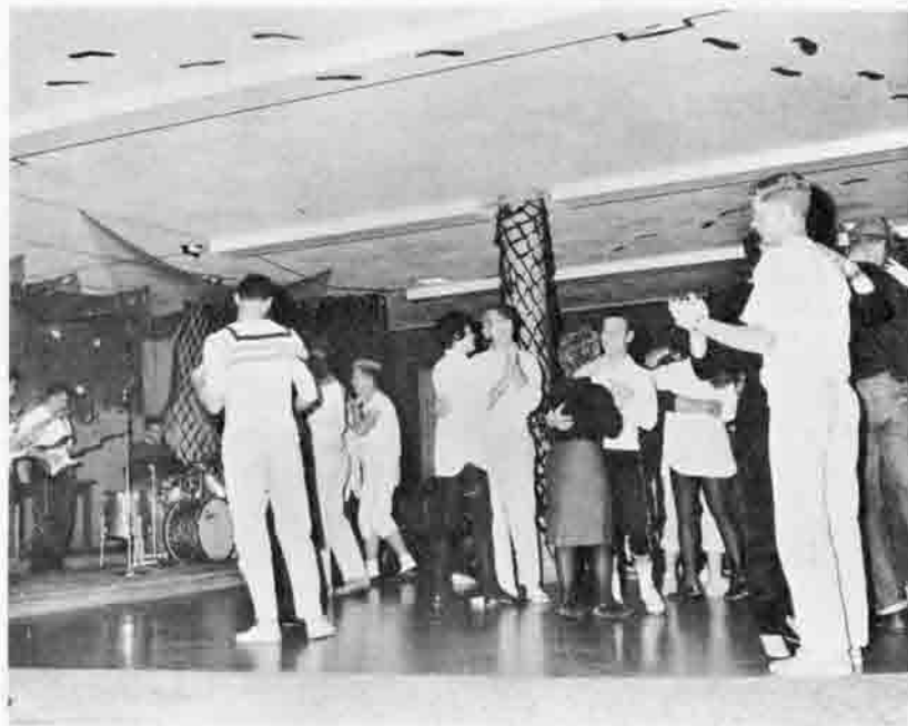
DRESSED IN TYPICAL beatnik attire, MUNRC students and guests dance to the music of the Starlighters at the "Bongo Blast", November 19.