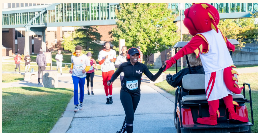
This fall, UMSL RA members volunteered to help out with the Annual Alumni 5k Walk/Run.

Since its inception many years ago, the UMSL Retirees Association has been supported by the campus, both in planning and executing activities and programs designed for retirees. With budget constraints and personnel changes, these support activities have been curtailed to the point of becoming virtually nonexistent.