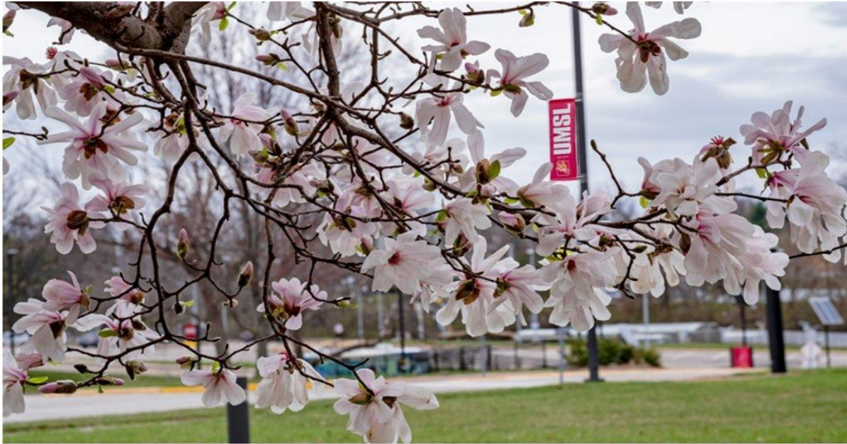
UMSL received the Arbor Day Foundation's Tree Campus Higher Education certification for the third straight year in recognition of its efforts to cultivate and maintain trees on campus.