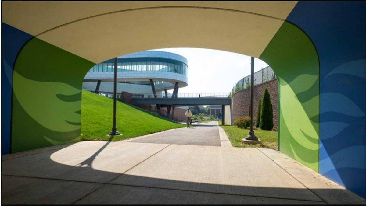
A cyclist rides along the St. Vincent Greenway and Wayne Goode Trail, past the Recreation and Wellness Center, and toward the tunnel passing under Arnold B. Grobman Drive.