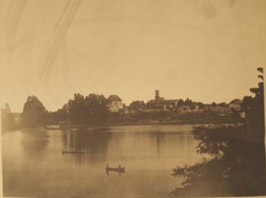
CHOUTEAU POND 1850.