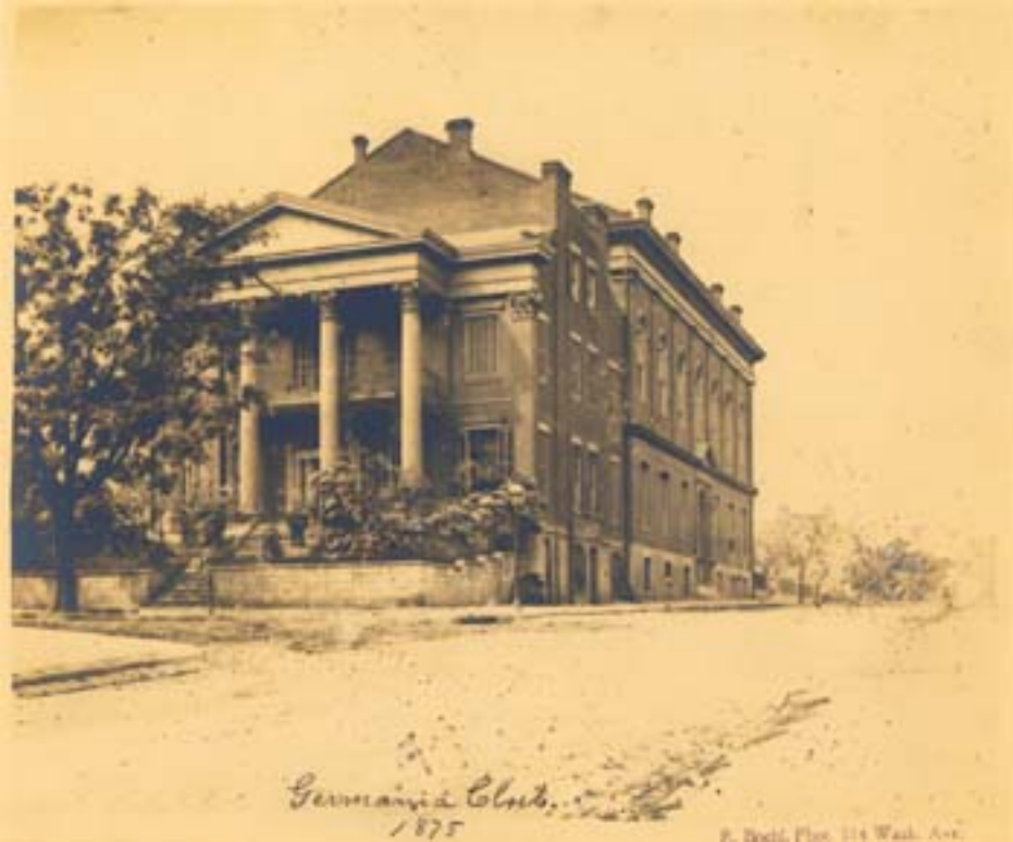
Germania Club, 1875