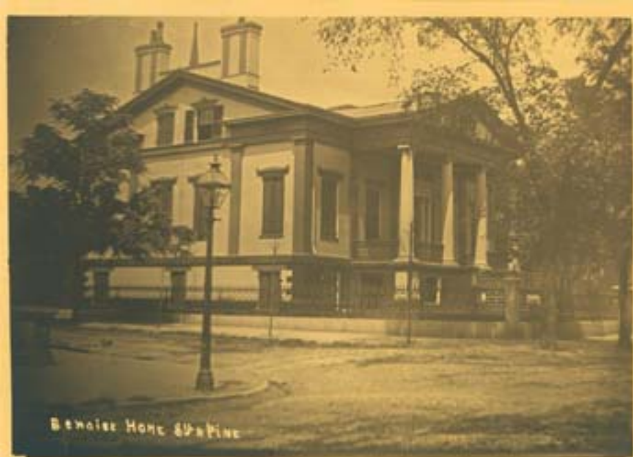
Benois Home for the Blind