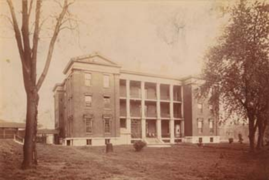
OLD MARINE HOSPITAL