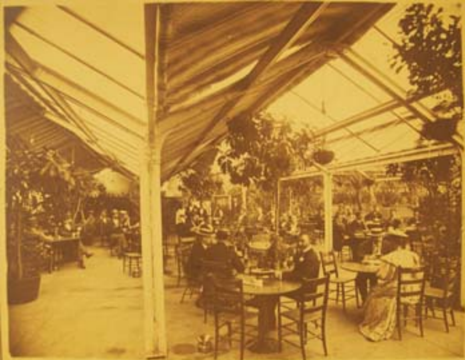
Hotel Garden & P. Alley 1874