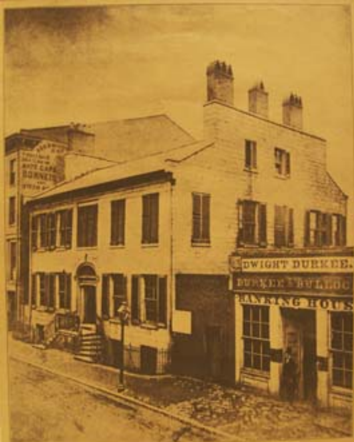
PIERRE CHOUTEAU RESIDENCE

8401 630 00 MAIN STREET SOUTH OF WASHINGTON AVENUE BUILT IN 1870