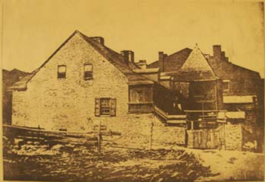
BENOIST RESIDENCE IN 1790

NORTHEAST CORNER OF MAIN AND ELM STREETS