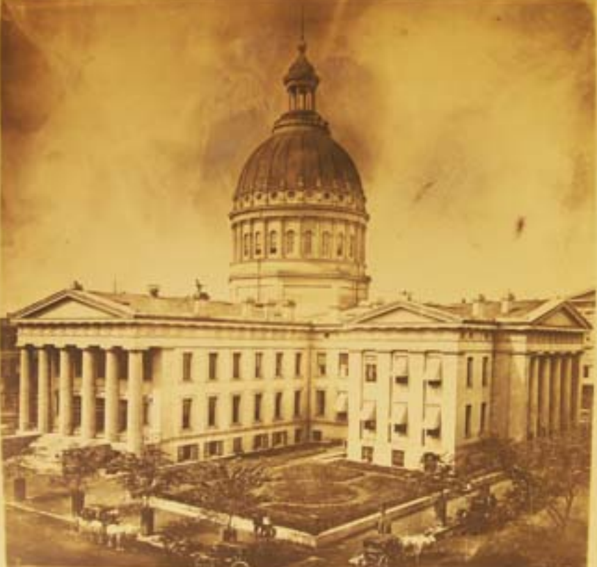
E. BOCKL, PHOT. 1870.