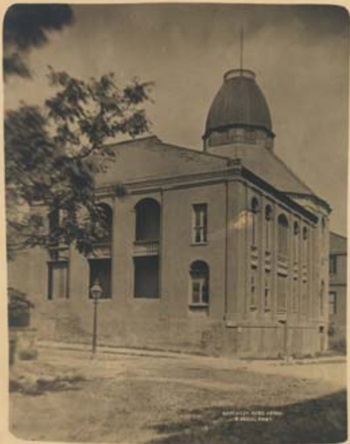
WATERBURY, MASS. 1880 W. B. BROWN, PHOT.