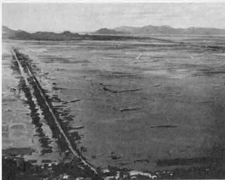
Looking across flooded rice lands into Cambodia

This describes a movement from 1965 to 1962 in South Vietnam conducted by the North Vietnamese. The idea they started out to obtain appealed to the people; but from 1962 until the present they have been forced to take a more demanding role because of the high cost of their "noble liberation war." Where they stand and how much force they have to apply to stand there are the questions for the next look at Vietnam.