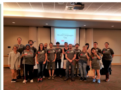
Some of our many volunteers gathered after the event.