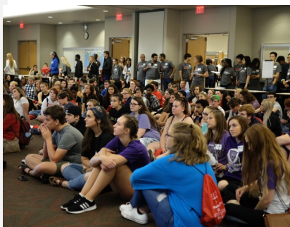
Students and volunteers gather for the opening ceremonies.