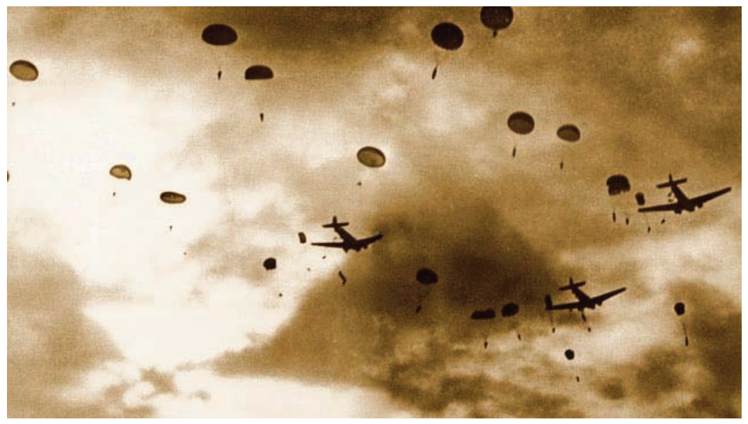
Germans pour into Crete by air