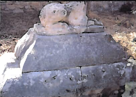
Captain Parker's Grave