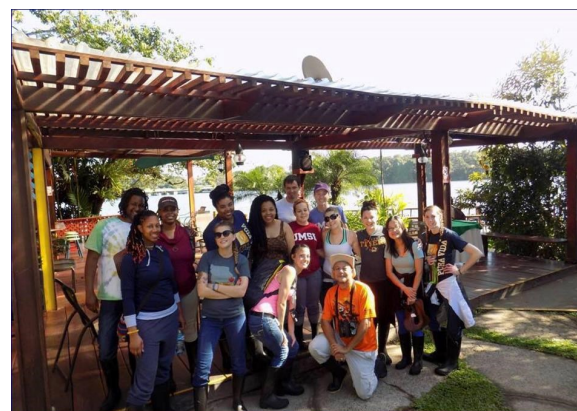
Faculty-led program to Costa Rica, Winter Intersession 2016.