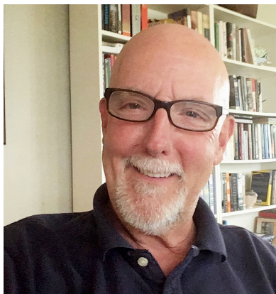
Earl Swift journalist and author

EARL SWIFT is the author of eight critically acclaimed books and hundreds of major features for newspapers and magazines. While chasing stories over his forty-year career, he has lived for fourteen months on a remote island, camped for weeks in the Laotian jungle, excavated a crashed World War II bomber in Papua New Guinea, made numerous tailhook landings on aircraft carriers, and waded alongside six-foot catfish in the sewers of St. Louis. He's also through-hiked the Appalachian Trail, circumnavigated the Chesapeake Bay by sea kayak, and survived close encounters with bears, rattlesnakes, scorpions, stingrays, venomous centipedes, and Pentagon bureaucrats. He was a Fulbright fellow to New Zealand in 1994, and has been a Virginia Humanities fellow at the University of Virginia since 2012.