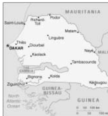
Republic of Senegal

The Applied Research Seminars are held once a month on Wednesday afternoons from 12:00—1:30 p.m. For more information check the Friday's Update or call 516.5273.