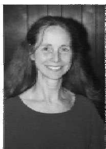
University Outreach & Extension Community Development