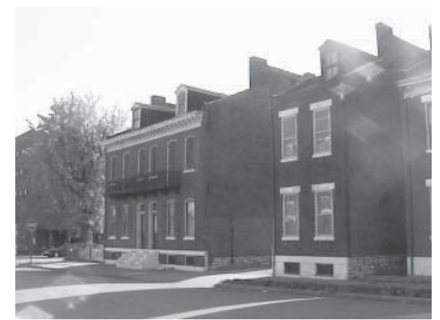
Images from the Old North Neighborhood Partnership Project in Old North St. Louis City.