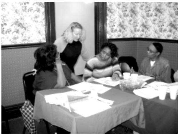
Financial Literacy classes, held at Johnny's Bar and Grill in Old North St. Louis

The Community and Neighborhood Development (CND) Unit of PPRC assisted in the development and incorporation of MidCounty Partners For Progress, a nonprofit organization representing twenty-two municipalities, along with private and nonprofit partners in the Normandy School District area. CND staff assisted in the formation of the organization and provided technical