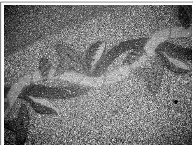
DETAIL OF A STENCILED VINE ON THE TRAIL