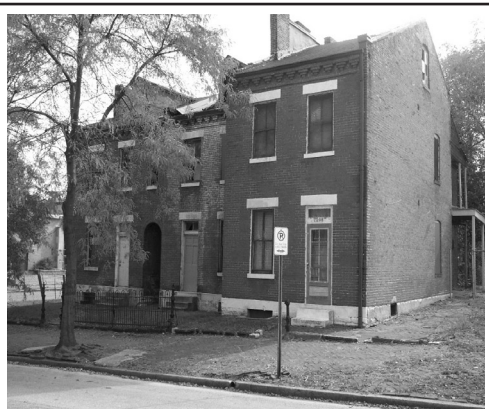
THE PUBLIC FINANCE INITIATIVE CONDUCTS RESEARCH ON POLICIES AFFECTING GOVERNMENTAL REVENUE AND EXPENDITURES. RECENT STUDIES HAVE FOCUSED ON PROPERTY TAX VALUES ACROSS MISSOURI.

A second study, What's the Value of Missouri Farmland? Examining the History and Outcomes of the Tax Policy Based on Productive Capacity , describes and explains Missouri's experience with the use of productive valuation rather than market values for taxing farmland. It also provides a comprehensive description of the effects of this policy over the last twenty years. Furthermore, by comparing valuations using several indicators of value, it raises significant questions for future research and policy debate.