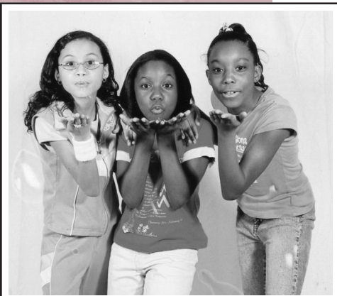
AFTER THE SUPREMES: GO GIRLS' CD COVER, AN IMAGE FROM THE UPCOMING “2READ + 2WRITE = 4MUSIC” EXHIBIT

The exhibit is co-sponsored by Allied Photo-color, The Regional Arts Commission, Missouri Arts Council and Arts and Education Council of Greater St. Louis. ♡