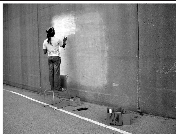
PREPARING THE FLOOD WALL FOR POEM STENCILS

The project, funded by grants from the Regional Arts Commission and the Great Rivers Greenway, seeks to enhance the section of the trail that runs north from downtown St. Louis. The completed project will grace the trail until the area undergoes revamping efforts in 2007. The poems can be viewed on the flood wall along the trail between the ADM Silo and Mosenthein Island. ♡