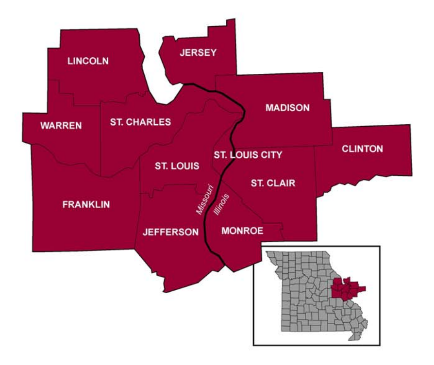
St. Louis, MO-IL Metropolitan Region