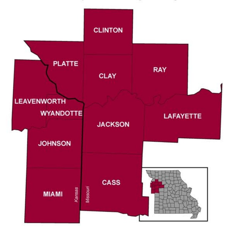
Kansas City, MO-KS Metropolitan Region