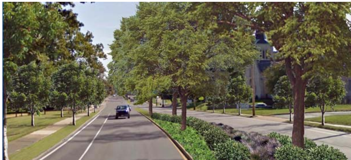
New Natural Bridge at UMSL