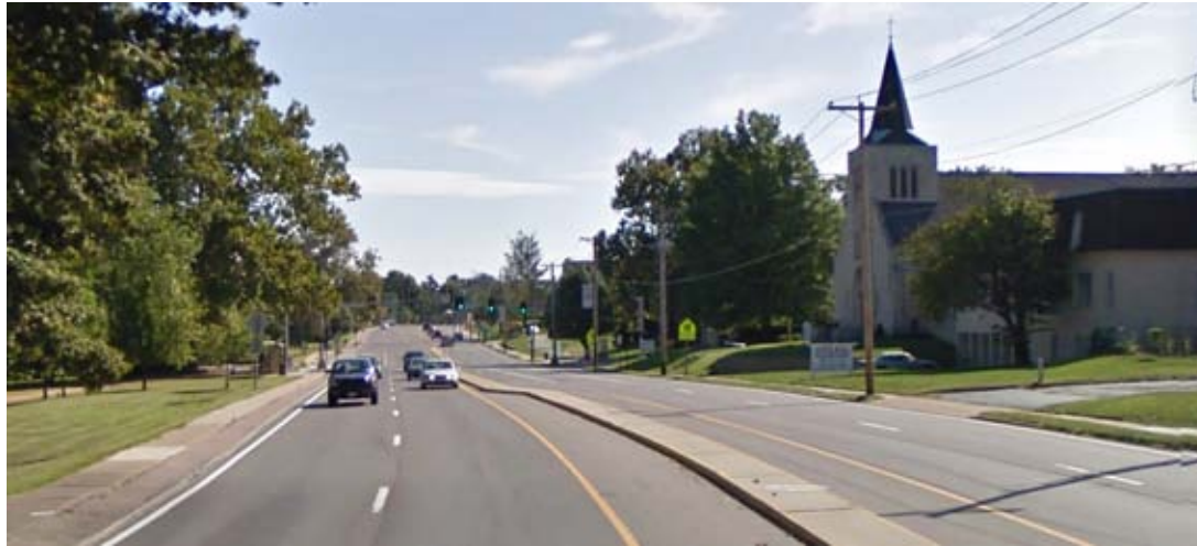
Current Natural Bridge at UMSL