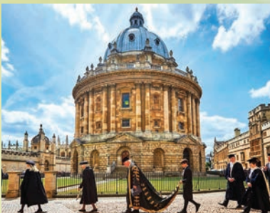
University of Oxford