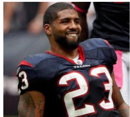
Arian Foster Houston Texans Philosophy Major

Those who major in philosophy as an undergraduate are often admitted to graduate programs in other fields, because admissions committees understand how well-prepared philosophy students are.