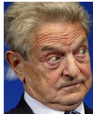
George Soros Investor Philosophy Major

Majoring in philosophy may not be the quickest path to wealth. But it is a good path for lifelong happiness. These salary averages are for people with no academic degree beyond the Bachelor's degree. But can majoring in philosophy help you if you choose to go to graduate or professional school instead?