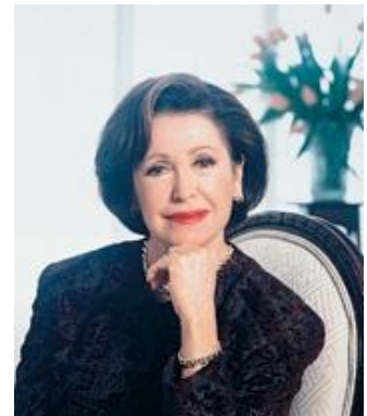
Mary Higgins Clark Novelist Philosophy Major

These last two points are connected. Because the kinds of issues philosophers focus upon are so abstract and important, it becomes necessary to think in a very logical and hard-headed manner in order to gain any intellectual traction that may lead to progress. You don’t learn how to think well by studying the easy stuff.