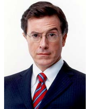
Stephen Colbert Comedian Philosophy Major

Those who have majored in philosophy at UMSL are now—among other things—professors, physicians, contractors, information systems specialists, pilots, attorneys, statisticians, entrepreneurs, organizational presidents and a host of other professionals.