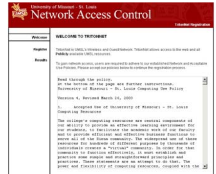
Main Campus Manager Page