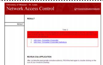
Computer Failure Screen