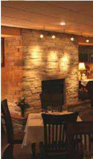
The Smart Card will get you a 10% discount at Oscar's Café.

Maid Rite Diner—15% off all purchases and a free straw