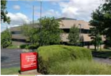
West County Continuing Education Center