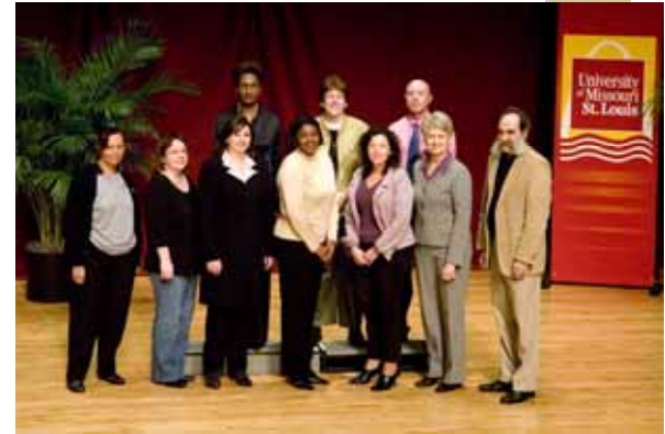
Approximately 60% of Benefit Eligible staff are female. Photo taken at the Staff Award Ceremony 2009 by August Jennewein.

Source: PeopleSoft file cw_rpt_Link Benefit Eligible Staff