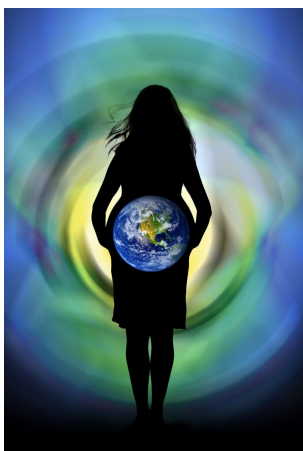
Women Taking the Lead to Save Our Planet 2009 Trailblazers