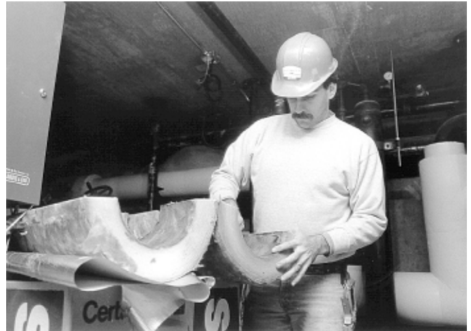
Insulation workers install insulation around pipes and within walls and floors.

When covering a wall or other flat surface, workers may use a hose to spray foam insulation onto a wire mesh. The wire mesh provides a rough surface to which the foam can cling and add strength to the finished surface. Workers may then install drywall or apply a final coat of plaster for a finished appearance.