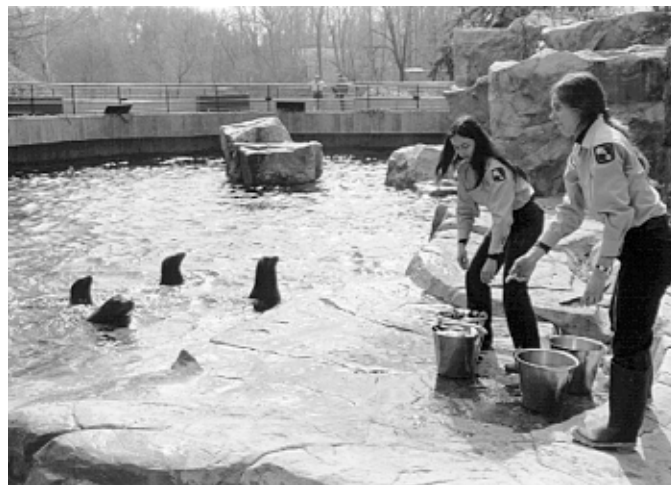
Animals have to be fed every day, so animal care and service workers often work weekend and holiday shifts.

Animal trainers train animals for riding, security, performance, obedience, or assisting persons with disabilities. Animal trainers do this by accustoming the animal to human voice and contact, and conditioning the animal to respond to commands. Trainers use several techniques to help them train animals. One technique, known as a bridge, is a stimulus that a trainer uses to communicate the precise moment an animal does something correctly. When the