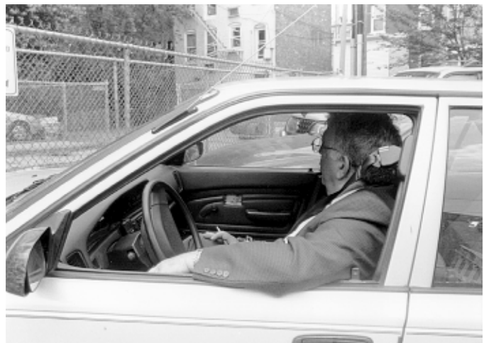
One of the hallmark skills of private detectives and investigators is surveillance.

Detectives who work for retail stores or hotels are responsible for loss control and asset protection. Store detectives , also known as loss prevention agents , safeguard the assets of retail stores by apprehending anyone attempting to steal merchandise or destroy store property. They prevent theft by shoplifters, vendor representatives,