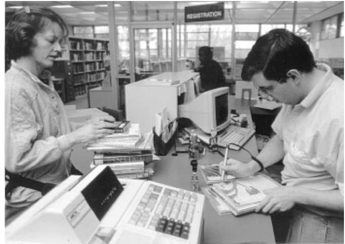
Library assistants check out books to library patrons.

Throughout the library, assistants sort returned books, periodicals, and other items and return them to their designated shelves, files, or storage areas. They locate materials to be loaned, either for a patron or another library. Many card catalogues are computerized, so library assistants must be familiar with the computer system. If any materials have been damaged, these workers try to repair them. For example, they use tape or paste to repair torn pages or book covers and other specialized processes to repair more valuable materials.