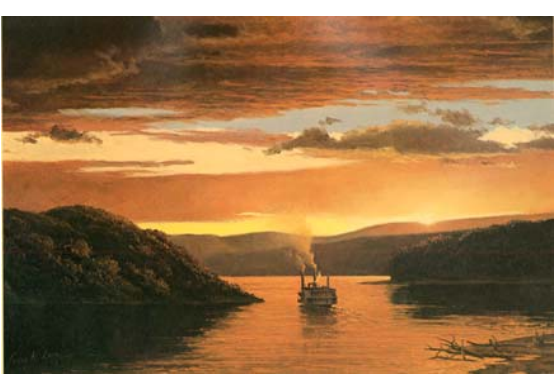
Which of these depict Missouri? What do you see that makes you think so? What do you think of when you think of Missouri landscape? Which Missouri region might the pictures be from? Why do you think the other paintings do not show Missouri landscapes?