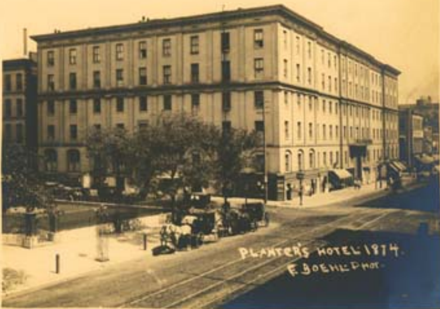
PLANTER'S HOTEL 1874.