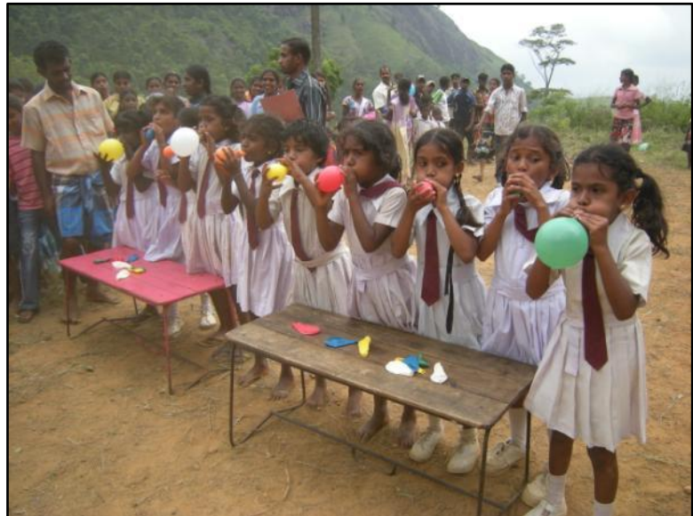
Third grade girls in the balloon race