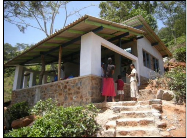
Near Completion (10/2009)

Our official opening ceremony was held on September 12, just before I returned to the U.S. In addition to receiving their school uniforms, backpacks, and sandals, we opened children's savings accounts for each of the new enrollees (500 rupees each, or approximately $5). Staff from People's Bank in Koslanda attended the opening to distribute the children's savings passbooks. We are planning a matching feature for this program—each year, when parents continue to deposit funds into their children's accounts, we'll match their contribution up to 1,000 rupees. We aren't charging an enrollment fee for children at the Montessori; instead, parents will volunteer one hour each month at the Montessori as their child's enrollment fee.