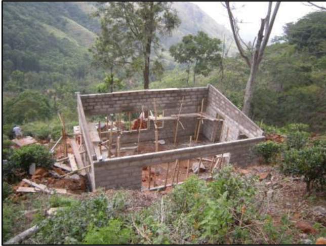
Montessori – Under Construction (8/2009)