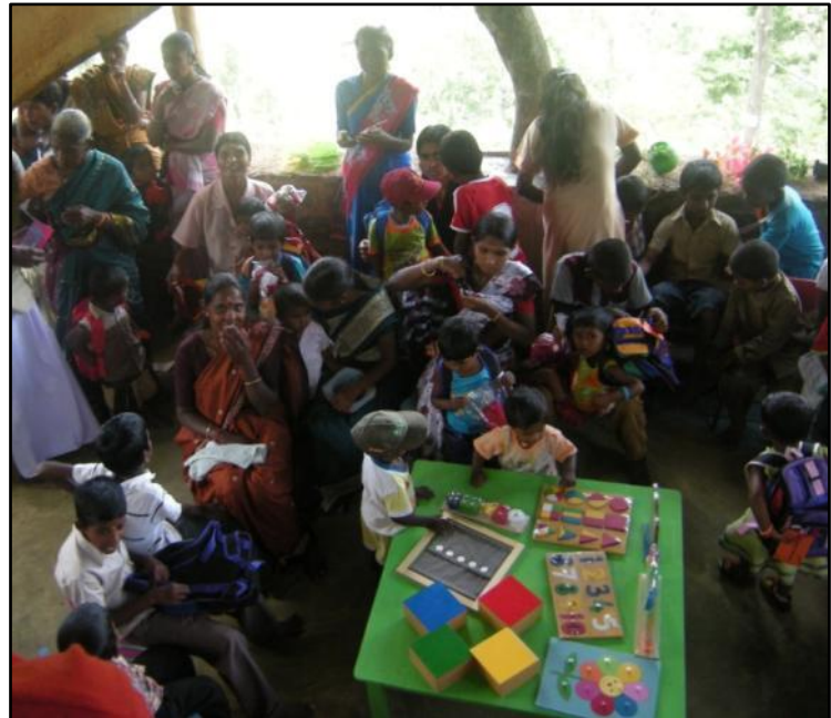
Kids explore the Montessori's equipment and educational toys