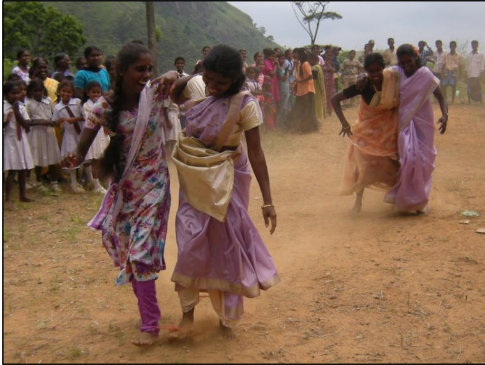
Macaldeniya moms run the three-legged race