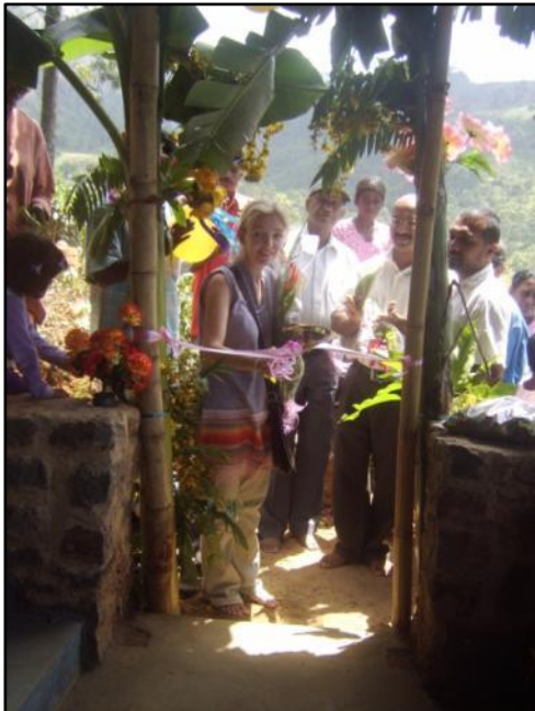
Ribbon cutting at the Montessori opening

Our official opening ceremony was held on September 12, just before I returned to the U.S. In addition to receiving their school uniforms, backpacks, and sandals, we opened children's savings accounts for each of the new enrollees (500 rupees each, or approximately $5). Staff from People's Bank in Koslanda attended the opening to distribute the children's savings passbooks. We are planning a matching feature for this program—each year, when parents continue to deposit funds into their children's accounts, we'll match their contribution up to 1,000 rupees. We aren't charging an enrollment fee for children at the Montessori; instead, parents will volunteer one hour each month at the Montessori as their child's enrollment fee.