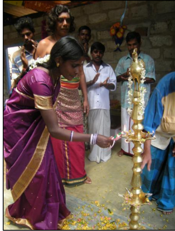
Lighting the oil lamp at the Montessori opening

Each child who enrolled in the Montessori received a new backpack, sandals, handkerchiefs, and school uniforms (two shorts and three shirts for boys; two dresses and three shirts for girls).