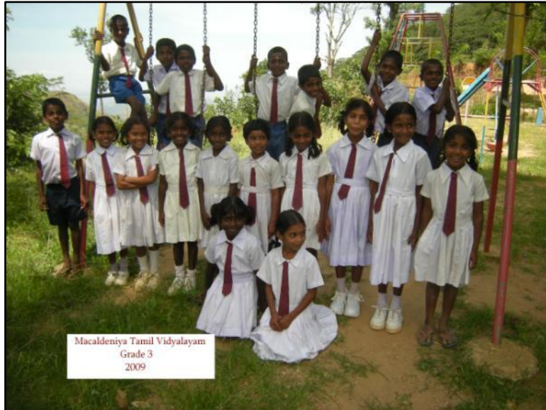
Macaldeniya Third Graders

Finally, as in years past, we've taken annual school photos at Macaldeniya Tamil Vidyalayam, to provide the kids and their families with this important record of their transitions through childhood. Each child received a copy of their individual portrait and class photo.