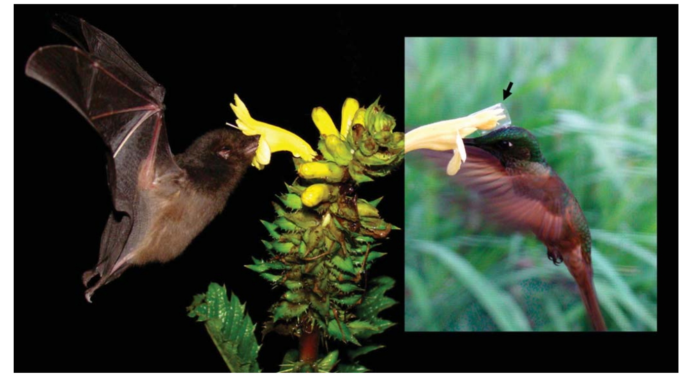
FIG. 1. An inflorescence of Aphelandra acanthus , with a visit by a bat ( Anoura fistulata ) on the left and a hummingbird ( Heliodaxa rubinoides ) on the right. Note the loop of tape marked by an arrowhead, which was used to quantify pollen transfer.

(using the Nightshot mode), for a grand total of 253.7 h of footage. Because inflorescences contained from one to three open flowers at any given time, it was often possible to video-tape more than one flower with each camera (on average, 2.1 flowers diurnally and 1.8 nocturnally). Visitation rates were defined as visits per flower per hour; for this calculation, the total number of flower-hours was 243.2 diurnally and 235.5 nocturnally.