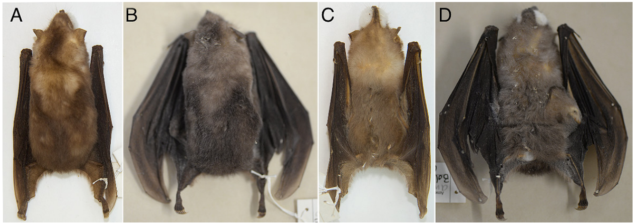
Figure 3. Anoura latidens fur coloration. A, C. Anoura latidens , holotype, USNM 370119. B, D. AMNH 264604.