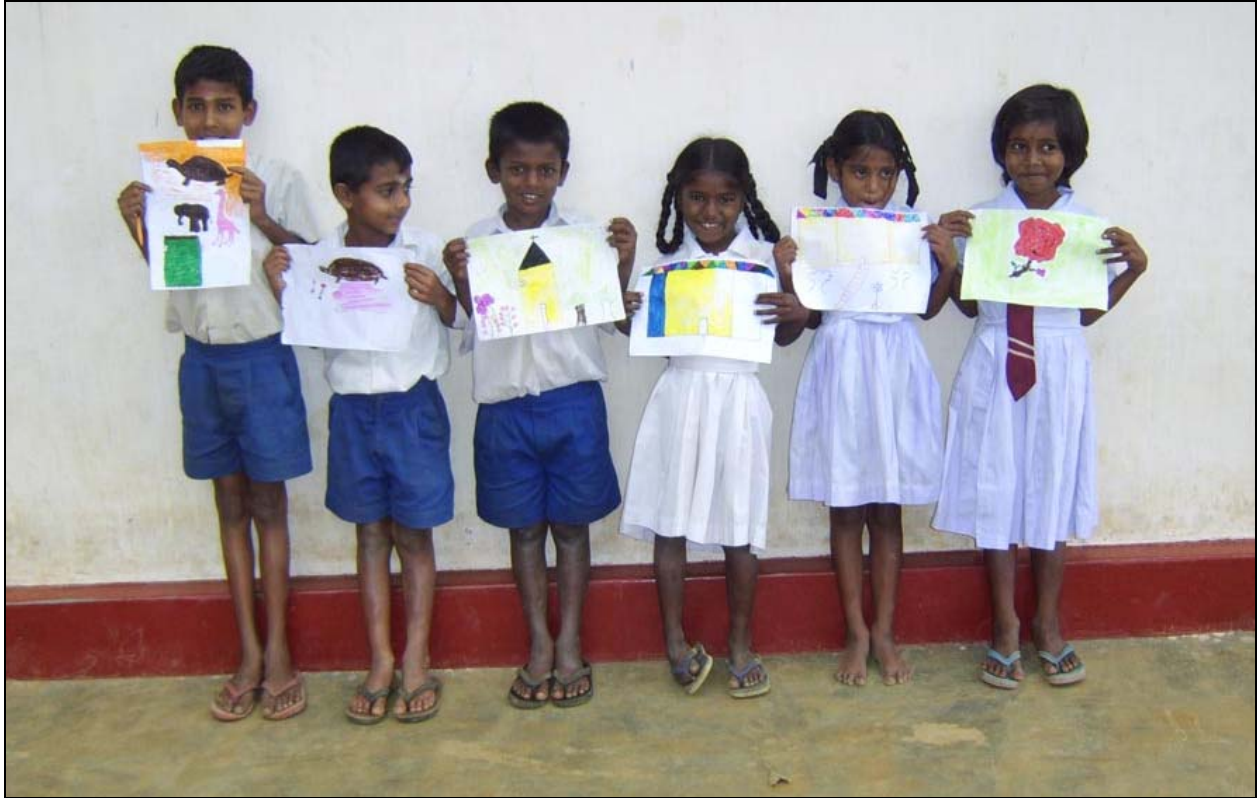
Third graders show off their drawings