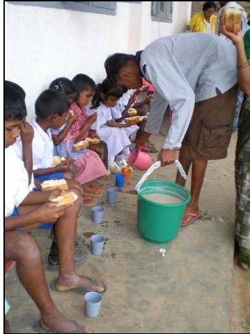
Distribution of hot tea