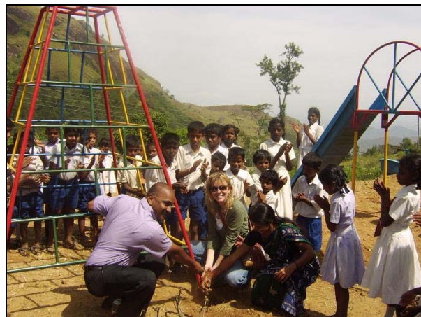
Ceremonially placing the first handfuls of sand during playground installation