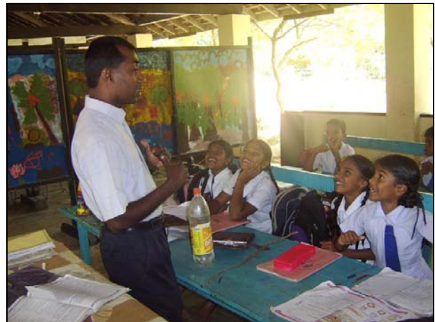
back to school on Monday