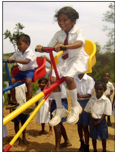
Macaldeniya children enjoy the new playground