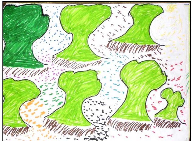
Tea Estate By Thanaletumi, Grade 5