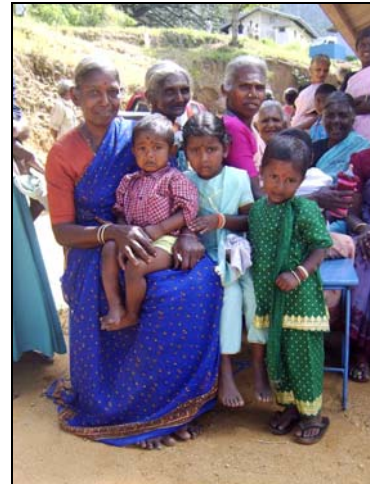
Waiting in queues...