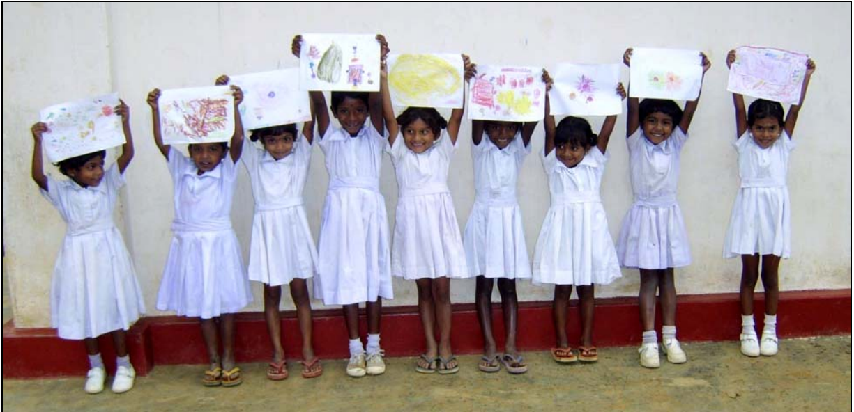
First Grade Girls Show Off Their Drawings

In June 2007, we had an art workshop at Macaldeniya Tamil Vidyalayam, and the children produced drawings that I brought back with me to incorporate into our fundraising activities.