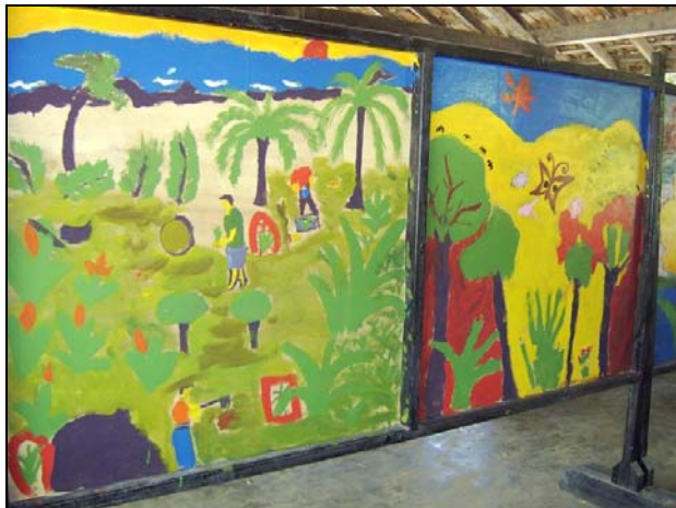
brightly painted wall partitions