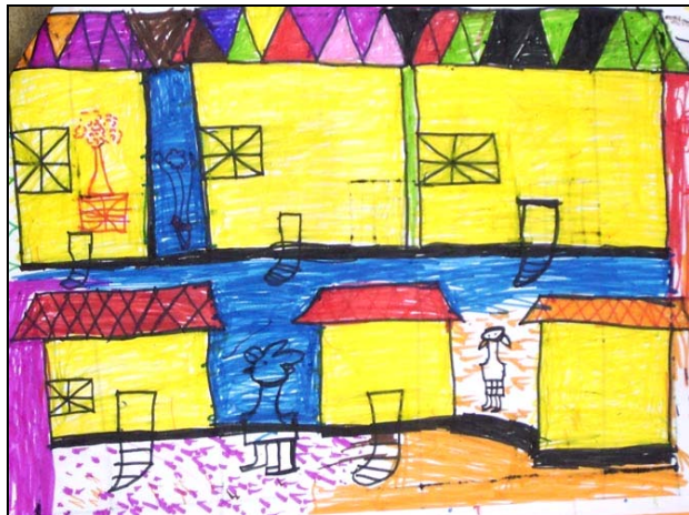
Estate Homes By Gurukumar, Grade 4