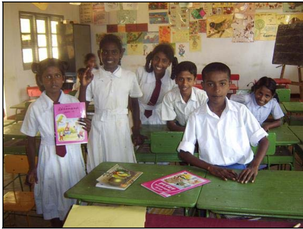
Students pose in the now colorful classroom