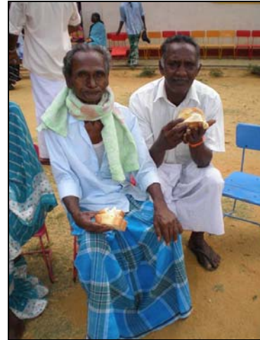
Enjoying a snack